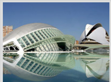
Valencia's City of Art and Science.

A joint meeting of the "European Committee for Future Accelerators Study of Physics and Detectors for a