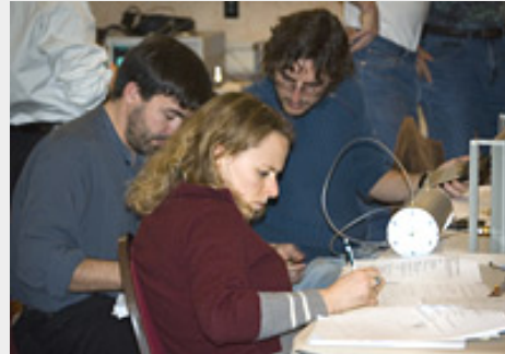
Students at the last winter session of the USPAS in January 2006 at Arizona State University.

Every year for roughly the past twenty years, the U.S. Particle Accelerator School has organised two-week-long summer and winter sessions, comprised of courses for the scientific and engineering communities in the field of particle physics, nuclear physics, basic energy sciences, fusion and related accelerator technologies. Providing specialised accelerator physics and engineering courses that are not often available at universities, the USPAS has helped train thousands of students over the years, including more than 500 international participants and more than 1600 individuals from Department of Energy and National Science Foundation laboratories. The average attendance at USPAS sessions is about 130 students. This year, Texas A&M University will sponsor the winter session of the USPAS in Houston, Texas from 15-26 January 2007.