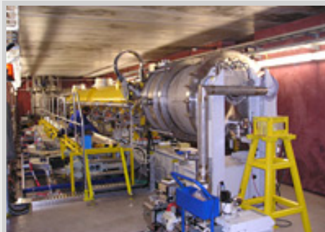
Module 6 sitting on the test stand, ready to be scrutinised.