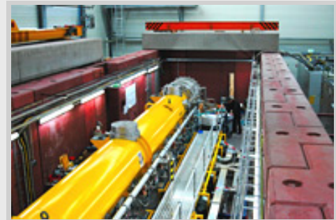
A brand-new test stand at DESY puts complete modules under the test. The performance of the module, its cavities, couplers and cables can be examined in great detail.

"ILC test subject" Module 6 is now probably the best-known cryomodule ever. However, best-known does not imply best-understood: Even though there weren't any leaks and six of the cavities performed wonderfully, each reaching the designated gradient of 34 megavolts per metre, there were two odd ones out that only reached 22 megavolts. "This is not dramatic as FLASH requires an average gradient of 26 megavolts per metre and Module 6 still delivered 30, but we would still like to understand what makes them different from the rest because all eight cavities had exactly the same treatment," explains Rolf Lange. Module 6 will be inserted into FLASH in April. All future modules will spend time in the test stand –