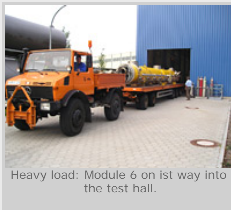
Heavy load: Module 6 on its way into the test hall.