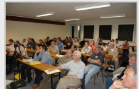
Attendants during the workshop