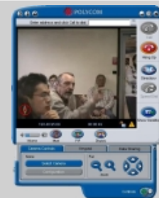
A live webcast was available during the workshop