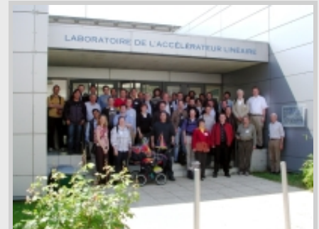
Group photo of the ILC Software Workshop, in front of LAL entrance

Workshop links : Website - Talks - Photos