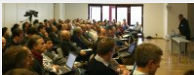
Crowding around a new detector concept: the first ILD workshop took place in Zeuthen near Berlin in January

A global project like the ILC depends on global cooperation. The contributors are scattered all over the world. Researchers cannot simply walk down the hall to get advice from a colleague because he is likely to sit somewhere half a world away. However, there is technology that helps scientists to cover these distances virtually: discussions in internet forums and regular telephone and video conferences are part of any scientist's everyday life.