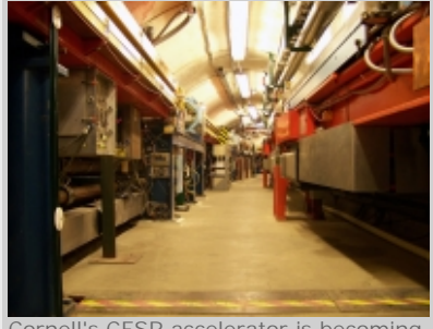
Cornell's CESR accelerator is becoming a test facility for ILC damping ring studies.

In order to cool the particles, accelerator experts send them through damping wigglers – a series of superconducting magnets that forces the electrons and positrons on a wiggly path so that they lose energy in the form of synchrotron radiation: X-ray photons. Physicists have installed superconducting wiggler magnets in the Cornell Electron Storage Ring (CESR) and know that the powerful magnets indeed reduce the size of the bunches. Unfortunately the intense flux of photons generated by the wigglers doesn't just disappear. Instead, they hit the beam pipe, knocking out electrons are kicked by the beam and then strike the walls of the pipe again, emitting even more electrons, until a whole cloud forms that can destabilise the beam, jeopardising the whole idea of damping, which of course was the starting point.