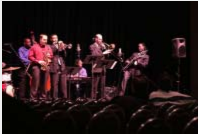
Click here to see the photo album of the meeting.

Chicago, windy city and city of Blues, may be the backdrop to this week's LCWS and ILC 08 meeting at the University of Illinois in Chicago (UIC) – but the ILC community sings an altogether more cheerful tune. More than 350 participants touched base on latest developments in detectors, machine and organisation and discussed old, new and controversial ideas. The International Detector Advisory Group and the Linear Collider Forum of the Americas met in parallel, and the meeting concludes today in a long plenary session.