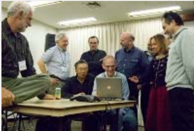
The task group for detector R&D met over lunch on Wednesday.

The LCWS08 and ILC 08-workshops are going on in Chicago right now. For many years, the LCWS workshops have brought together the physics and detector communities to discuss recent advances relevant to the linear collider. Many parallel sessions organised around physics and detector topics repeated the tradition. The physics sessions, in particular, are crucial to advance the project and the motivation of its people. This is also a very good occasion for the physics and detector community to communicate with our accelerator colleagues.