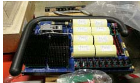
One of the Marx modulator cells, awaiting installation. (Photo by Calla Cofield. Click for larger image. )