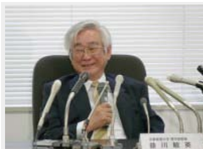
Maskawa smiling at the press conference.

An interview with Toshihide Maskawa, Nobel laureate of Physics