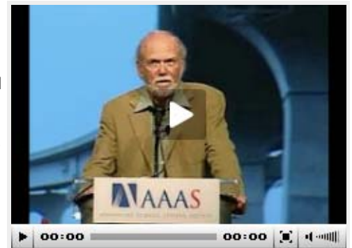
Watch the talk " New Frontiers in Particle Physics " or download the AAAS movie (Flash-format)

Read also AAAS.org and Science story on Barry Barish's address.