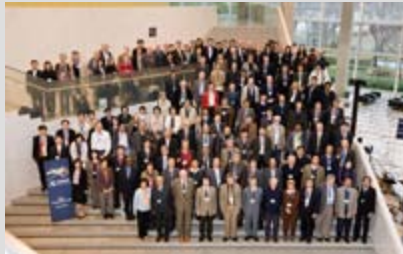
ASEPS participants gather on the steps of the EPOCHAL Center in Tsukuba.

A summit and the tip of the iceberg ASEPS summit in Tsukuba might change the research landscape