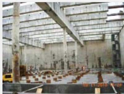
Inside the future European XFEL experimental hall.

Wilhelm Bialowons reports from the visit of the ILC civil facilities and siting group to the European XFEL and FLASH at DESY in Hamburg.