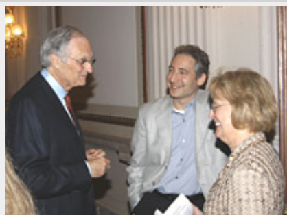
Quantum Universe Meets Hollywood: Actor Alan Alda (left), a science supporter and host of the PBS series "Scientific American Frontiers," chats with Brian Greene (center) and Representative Judy Biggert (right) at the R&D Caucus on 9 May in Washington D.C.

Have you ever tossed a ball at a wall, playing a game of one-man catch? As you tossed that ball again and again and again, have you ever thought about the chance that it could go right through the wall? According to quantum mechanics, this is a real possibility. "It's a small probability, but it is there," said renowned physicist and author Brian Greene, who addressed the Congressional Research and Development Caucus Advisory Committee in Washington, D.C. last week.