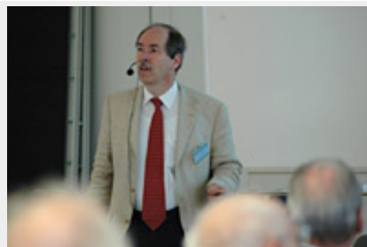
Nobel laureate Gerard't Hooft giving a speech on the future of physics

Less than a week after the good news of the EPP2010 report, recommending full American support for LHC experiments and the ILC, the Europeans sat down together to discuss their view of the future of particle physics. The almost 40 members of the CERN Council Strategy Group, the equivalent to the EPP2010 Committee, will write a draft strategy document for discussion and unanimous approval at a special meeting of the CERN Council in Lisbon in July. The outcome of the meeting in Zeuthen will not be made public until the CERN Council has convened in July.