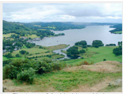
he town of Ambleside and Lake Windermere, viewed during the excursion at the 2003 school.