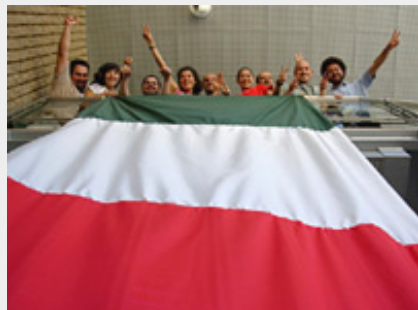
SLAC's Italian BaBarians celebrating their team's victory

If you were anywhere in Germany during the last month you couldn't have missed it: it was football world cup. Black-red-and-golden flags flying from windows, fluttering behind cars, decorating t-shirts, socks, beer mats, faces, shop windows, newspapers. If by chance you went to Hamburg you were greeted with a beautiful array of bright blue goals shining from every high-rise roof, harbour crane and all other landmarks in the city, and the public transport system didn't only tell you when the next train was due to arrive – it also had updates on the goals of every match that was on.