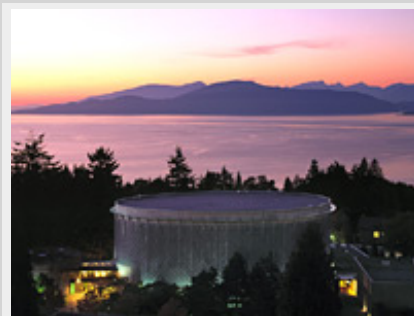
Vancouver Linear Collider Workshop, 19-22 July 2006