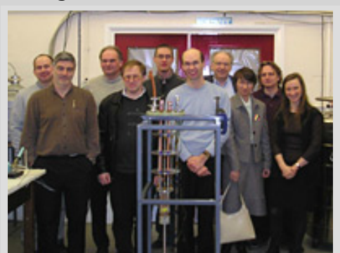
Members of the HeLiCal collaboration with the undulator ready for testing.

The ILC's positrons might be wondering where their second damping ring has gone and whether to get damped in the middle or at the end of the machine. Where they come from, however, is pretty clear, and teams in the UK and the US are making sure that their moment of creating is both well controlled and well understood. A 4th –generation undulator prototype has just been tested at Rutherford Appleton lab in the UK, and tests are looking very good.