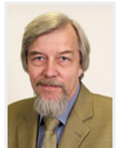
Rolf-Dieter Heuer, chair of the ILCSC Linear Collider Parameters Subcommittee

Clearly maintaining the two most fundamental parameters -- energy and luminosity -- is of highest priority in developing the machine design. The other very important statements made in the updated report regard the detectors. First, it reaffirms that "the interaction region (IR) should allow for two experiments. Two experiments are desired to allow independent and complementary