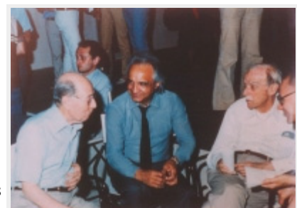
An historic photo of Antonino Zichichi in the centre with Eugene Wigner and Paul Dirac