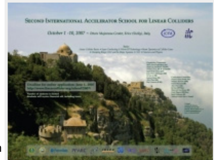
Poster for the 2 nd International School for Linear Colliders