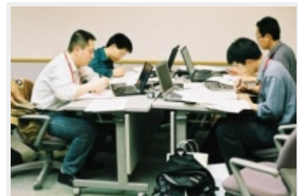
Students at the Sokendai Linear Collider School