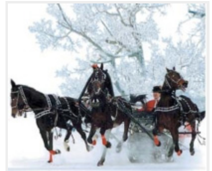
A troika, a Russian sled drawn by three horses