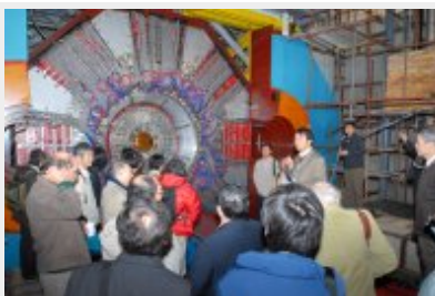
Participants at the CCAST workshop had the opportunity to tour BESIII, the detector of BEPCII at IHEP.

New expressways and subways are under construction. New hotels and apartment buildings are popping up. This city with a population of over 15 million people, which is already big enough, is getting ready for the coming year of increasing visitors who will attend the Olympic Games. This is Beijing.