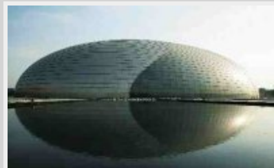
The symbol of the ILC workshop was the new Beijing National Grand Theatre: a cultural island in the middle of a lake near Tian An Men Square and the Forbidden City.

Beijing is a place to mark important ILC milestones. In 2004, the International Committee on Future Accelerators (ICFA) announced the decision to base the ILC acceleration technology on superconducting radiofrequency technology. In February 2007, we released the draft Global Design Effort Reference Design Report (RDR) for the ILC. This past week, in what I anticipate will mark an equally important milestone for the ILC, many of us attended the CCAST ILC Accelerator Workshop and first Asia ILC R&D Seminar under the JSPS Core-University Program. All three of these events took place in Beijing. This latter workshop featured both important high-level discussions with Chinese government officials as well as working level presentations and discussions about technical areas for Chinese involvement. I believe this combination will mark the beginning of an increasingly important Chinese role in ILC R&D and eventually in the project itself.