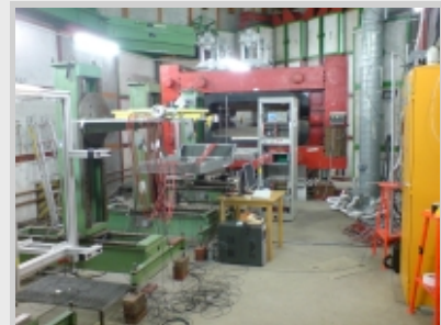
The polarimeter prototype in the test beam at DESY.