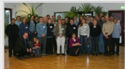
The combined positron source and polarisation collaborations at their meeting in April.