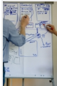
Flipcharts, spreadsheets and debates – the cost management group met at DESY in May.