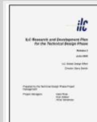
The ILC R&D Plan is released.