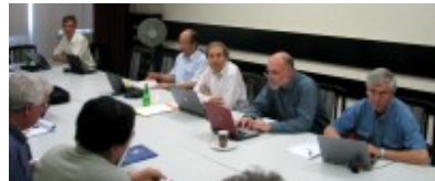
IDAG members at the last ILC-ECFA Workshop in Warsaw.

The first meeting of the International Detector Advisory Group (IDAG) for the ILC detectors was held in Warsaw during the ECFA Linear Collider workshop on 9 and 10 June. There were both open and closed sessions. The closed meeting became a good chance for the IDAG members to meet with each other, the Letter-of-Intent (LOI) representatives and research directorate members in order to share their views as to what their tasks are and how the validation process can be made.