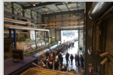
In April 2008, 76 000 visitors came to see CERN and the LHC underground installations during the CERN Open Day.

More about successful LHC synchronisation test Latest news about LHC start-up