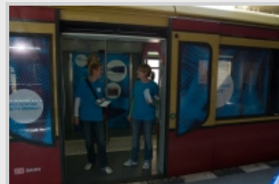
In Berlin, a city train was transformed into the "LHC Express", circling around Berlin for one night on 14 June to promote CERN, the LHC and the future exhibition in the "Bundestag" subway station.