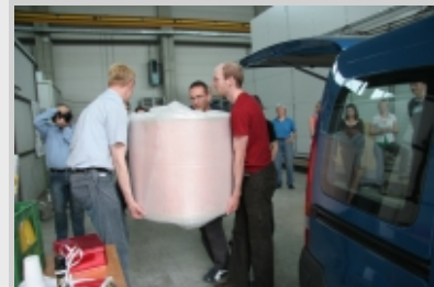
When the TPC field cage arrived at DESY, all TPC collaboration members came to watch and help out.

The international time projection chamber (TPC) team that works on R&D for future ILC detectors used to have a bit of a running gag. Somebody would proclaim that "the field cage will arrive next week" and everybody else would chuckle because week after week it didn't arrive. Chuckling days are over now: after several years of planning the cage for the large TPC prototype, ordering it from industry, checking the quality, rejecting parts of the product and reordering, the nearly one-metre-long barrel with an inner diameter of 72 centimetres has finally arrived at DESY in Hamburg. First tests indicate that it will finally meet the team's high requirements.