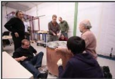
TPC collaborators from across the globe fit the endcap onto the TPC field cage.

Large time projection chamber prototype is about to start its first test