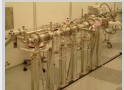
The assembled three-cavity string for the third-harmonic cryomodule.