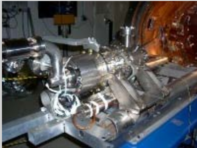
A third harmonic cavity about to go into the horizontal test stand.

The 3.9-Gigahertz "third harmonic" cryomodule is an essential ingredient to the FLASH free-electron laser at DESY in Hamburg, Germany, and one of Fermilab's contributions to the TESLA Technology Collaboration TTC that planned and built FLASH as a test facility for the superconducting radiofrequency technology needed for the ILC. Within FLASH, it will sit in front of the regular 1.3-Gigahertz accelerating cryomodules and play an essential role in the sorting and squeezing of the electron bunches. Unlike the regular ones that are supposed to accelerate the particle bunches as efficiently as possible, this module actually makes the energy distribution within the bunch more linear, which reduces the longitudinal emittance, thus leading to the production of brighter laserlight for users at the other end.