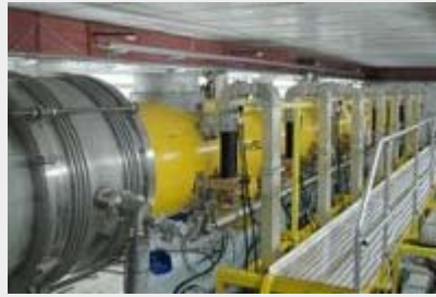
The cryomodule that set the world gradient record in the testbench at DESY

European-XFEL cryomodule using SCRF technology sets new record