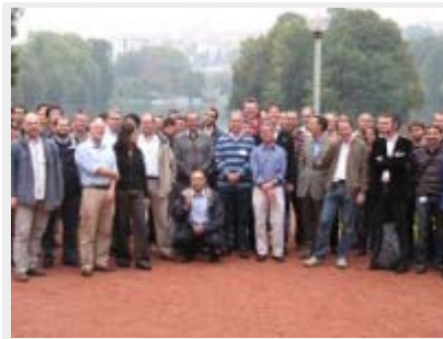
Part of the attendees of the CALICE meeting gathering at the Parc de la Tête d'Or in Lyon.

Just after the ILC concept detector validation report was released, the CALICE (Calorimeter for the linear collider experiment) Collaboration met from 16 to 18 September in Lyon, France. This meeting was the place of lively discussions on the most recent test beam results and strategies for the R&D and studies for the future as the collaboration is entering now a crucial and intense new phase. It was the most attended CALICE meeting ever and nearly all participating countries were represented.