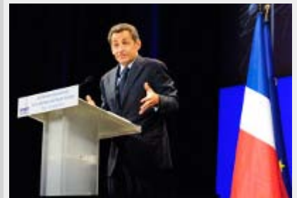
Nicolas Sarkozy speaking at ICHEP.