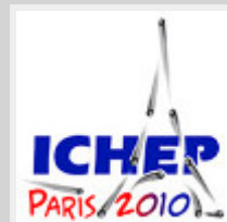
The 35 th International Conference on High Energy Physics

The 35 th International Conference on High Energy Physics (ICHEP10) held in Paris provided a first glimpse at results from the Large Hadron Collider. The very good control over machine