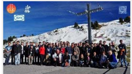
International Linear Collider School 2010 group photo